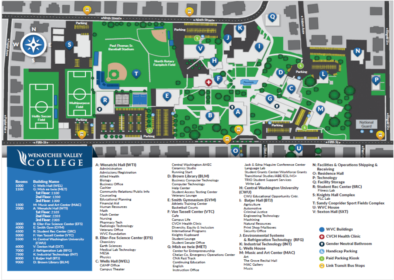
Clery geography for main WVC campus, 2022

Specifically, this includes any facility or address of 1300 Fifth St. Wenatchee, WA