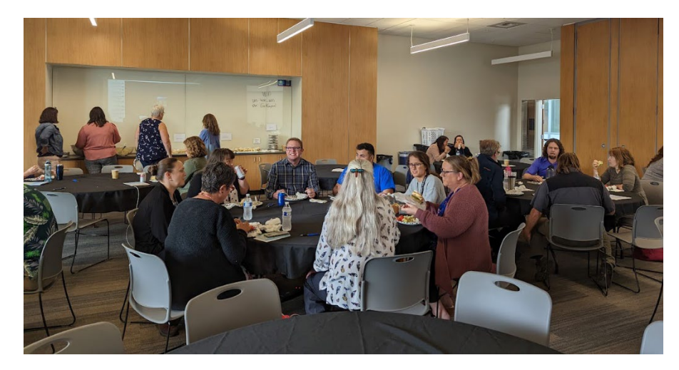
2 Faculty and staff participate in Deans' Days.

Launch Week included a variety of sessions and trainings to support faculty in their critical role of serving students. The schedule is attached. Thanks to the many presenters who provided expertise and support to their colleagues.